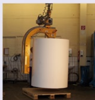
5. Set down